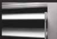
Clearview® hidden rear tilt